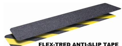
FLEX-TRED ANTI-SLIP TAPE

Visit us at www.congressassociates.com for more information on Wooster Products and our service offerings. Follow us on Facebook .